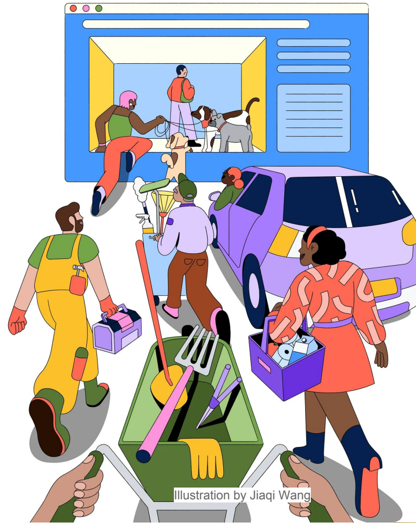
Illustration by Jiaqi Wang